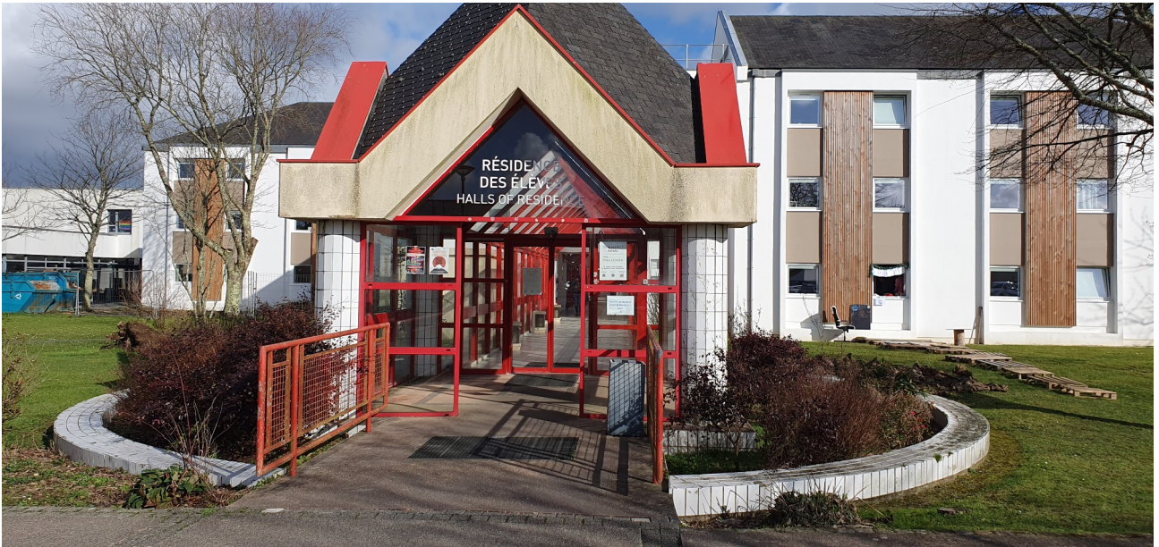
This is the Hall of Residence for students. The pupils' rooms are in the background. It's where the students of the ENSTA can live during school days. The first-year students have priority to live there. (Arthur)