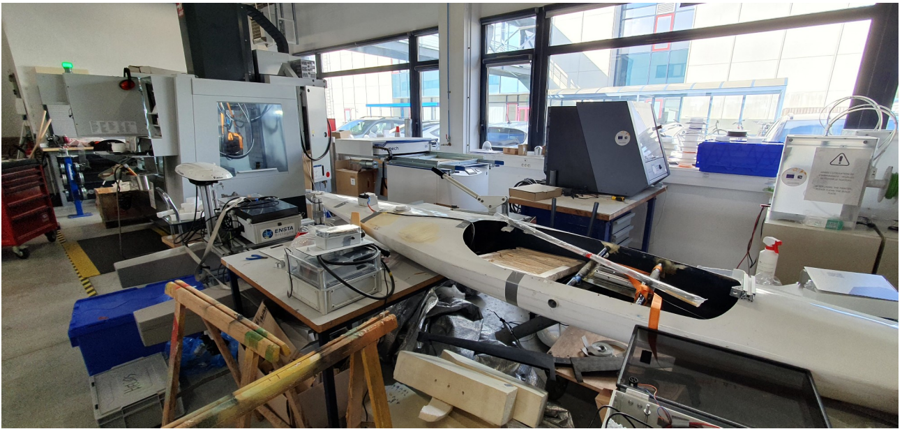
This is a photo of a laboratory where the students work. There is a boat and some other machines for students who create robots in ENSTA. The robots are designed to go on the sea. ( Maïna and Margot)